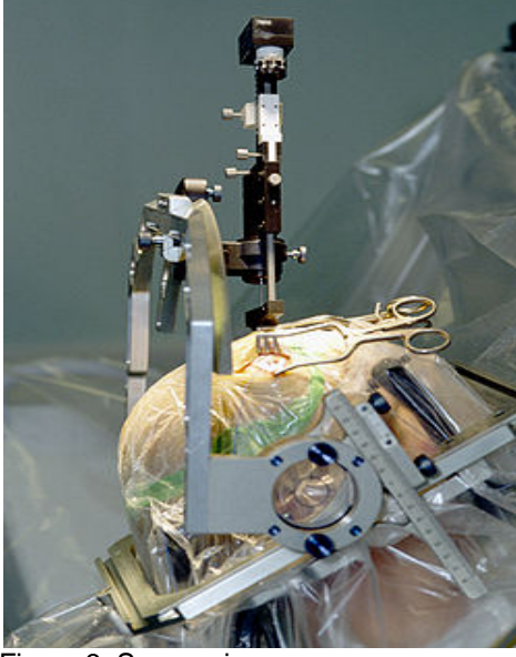
Figure 3: Surgery in progress